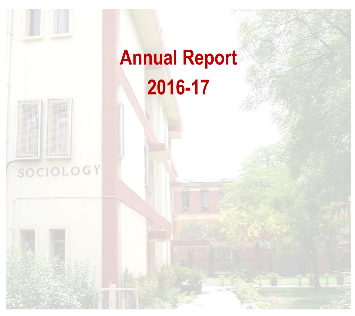
Department of Sociology University of Delhi Delhi